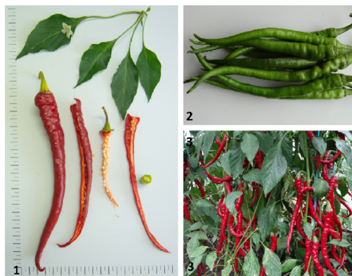
Figure 1. Roial fruit details: 1. Cross section; 2. Unripe fruit; 3. Crop detail

Roial cultivar (Figure 1) can be grown in greenhouse and in the field, in all pepper area crop favourable in Romania. The mean values of plant characteristics are presented in Table 1. The plant height of this variety varies from 66.6 to 83.2 cm with an average bush diameter of 39.3 cm. The length of leaves varies between 7.8-10.6 cm and a mean width of 4.43 cm. The flower colour is white without spots on the corolla. The colour of the anthers observed immediately after blooming before anthesis is pale blue and the filament colour observed immediately at anthesis is white. Due to these characteristics of flowers and because it presents elongated fruit shape [15]. Roial cultivar belongs to Capsicum annuum species.